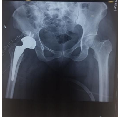
POST OP X RAY