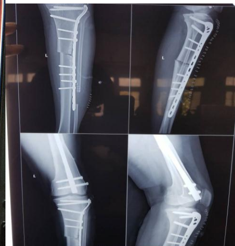
POST OP X RAY