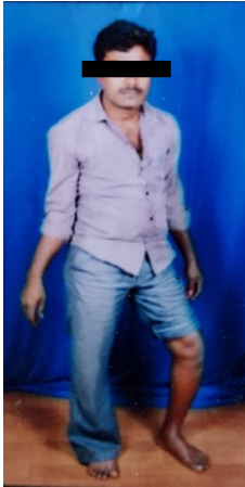
PRE OP CLINICAL PICTURE

35 year old male patient presented with varus deformity of left knee and with lengthening of left lower limb was subjected for corrective osteotomy and fixation