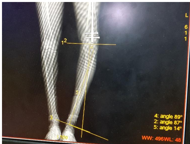
PRE OP X RAY