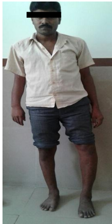
POST OP CLINICAL PICTURE