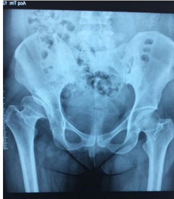
PRE OP X RAY