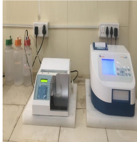
ELISA Reader with printer