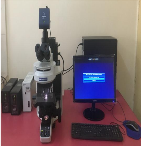
Trinocular Microscope with Phase contrast, Dark ground , Fluorescent