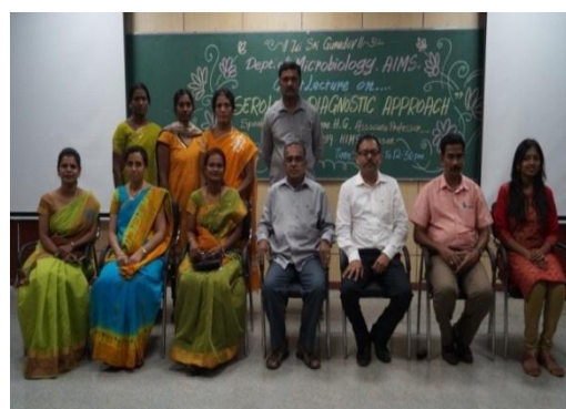
STAFF WITH GUEST SPEAKER – DEPARTMENT OF MICROBIOLOGY