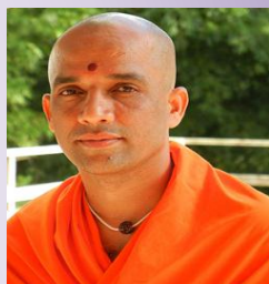
PARAMAPOOJYA SRI SRI SRI NIRMALANANDANATHA MAHASWAMIJI